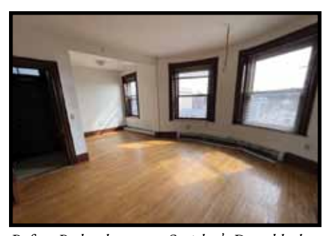
Before Redevelopment: Smith & Dow block apartment