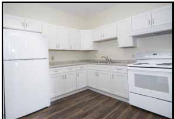
After Redevelopment: Smith & Dow block apartment

apital improvements and updates to 101 apartments located within two brownstone buildings on the northern end of Elm Street and th<mark>ree buildi</mark>ngs on Temple Court, all part of our RENEW II development, continue on track. The two Elm Street brownstone buildings, also known as the Carpenter and Bean block and Smith and Dow block, consist of 68 apartments, and the three Temple Court buildings located behind the Masonic Temple, also known as the Straw Mansion Apartments, consist of 33 units. These one, two, and three-bedroom apartments provide affordable housing to households whose income is at or below 50% and 60% of total median family income for the area, which is currently no more than $59,940 for a family of four in Manchester.