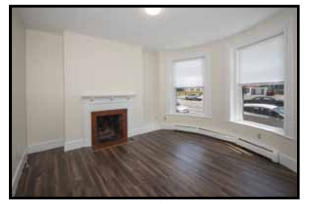
After Redevelopment: Smith & Dow block apartment