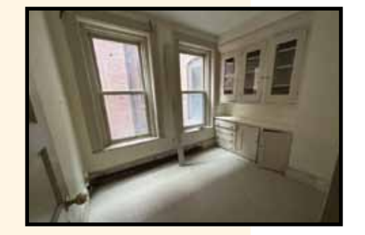
Before Redevelopment: Smith & Dow block apartment