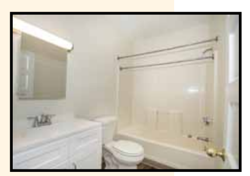
After Redevelopment: Smith & Dow block apartment