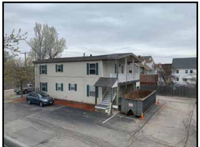
48 Ledge Street (after)