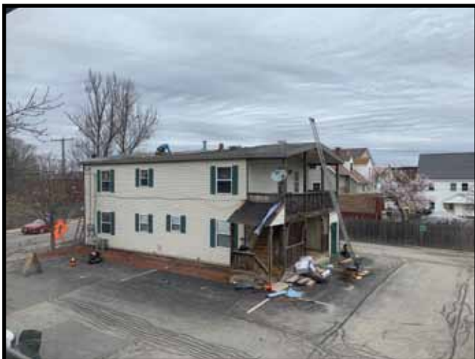
44 Ledge Street (before)