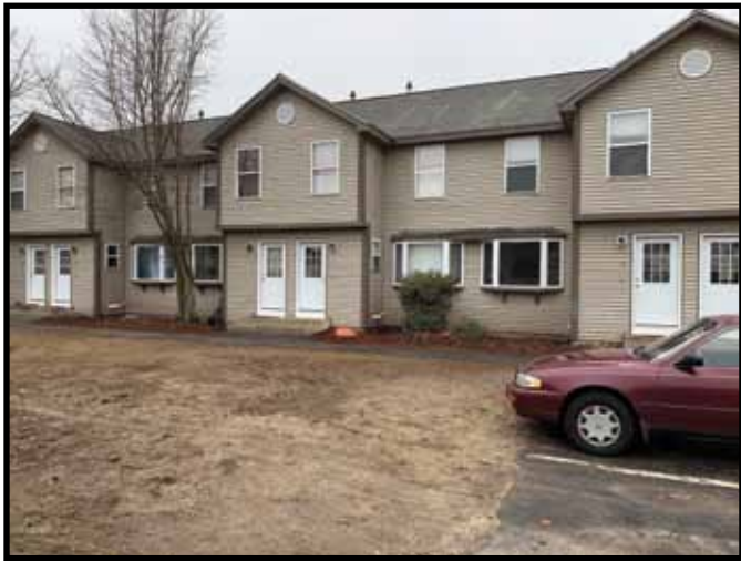
4-14 McLaren Avenue (before)

All work is slated for completion by the end of July.