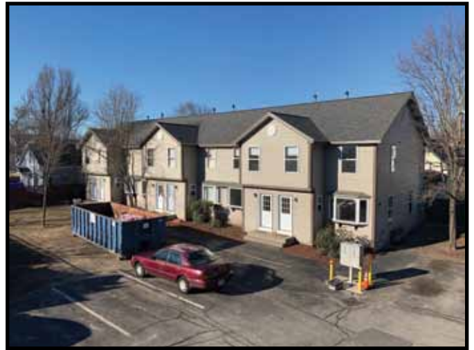
4-14 McLaren Avenue (after)